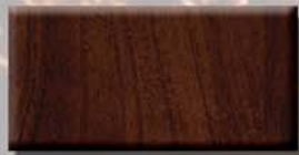
EB4246AC-50 Cracked Cherry