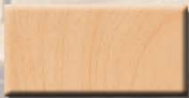
EB2427AC-50 Fusion Maple