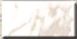
EB3609AC-50 White Marble