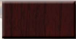
EB3218AP-50 Classic Cherry