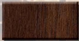
EB2010AC Dark Walnut