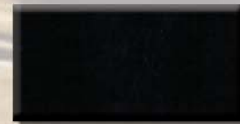
EB1003AC-50 Matte Black