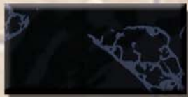
EB2633AC-50 Black Marble