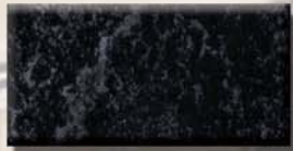
EB3604AC-50 Black Canyon Marble