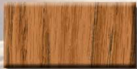
EB3175AP Woodland Oak