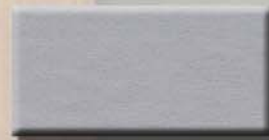
EB2900AC Satin Silver